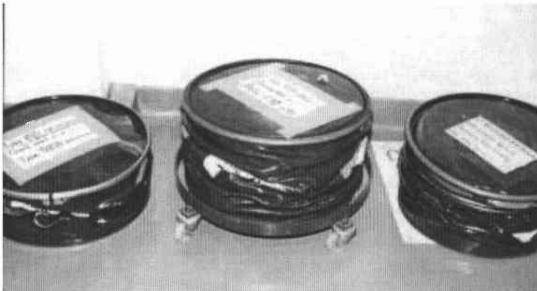
Figure 1. Pucks Produced by Supercompaction of 55-gallon Drums of Debris Waste in the AMWTP

The AMWTP will compact 55-gallon drums of debris waste and place the compacted drums into 100-gallon drums before shipment to the WIPP. The compacted 55-gallon drums are referred to as "pucks" (see Figure 1). The 100-gallon drums are referred to here as 100-gallon containers, or simply containers, to distinguish them from the 55-gallon drums. Each puck has a final volume of 15 gallons to 35 gallons, and each 100-gallon container is anticipated to contain from three to five pucks, with an average of four pucks per container.